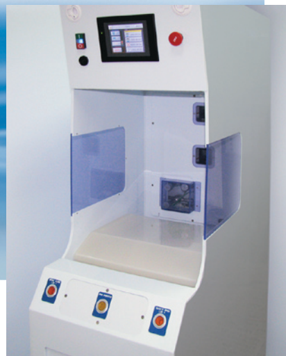
MTS Gradient Dryer is adaptable for silicon, solar, disk drive and other applications

Besides the elimination of watermarks on hydrophilic, hydrophobic and combination films, surface tension drying provides other benefits. This drying method does not place any mechanical stresses on the substrate. The technique works well on practically any flat substrate. No surfactants are necessary to change the substrate properties to enhance drying performance. Compared to traditional