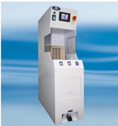
MTS Gradient Dryer stand-alone unit

The Gradient Dryer uses the difference between the surface tension of H 2 O and IPA to produce a gradient that generates fast and effective substrate drying. Surface tension gradient drying yields substrates that are watermark-free with low particle counts and no feature damage. Since there are no metallic components inside the dryer chamber, charge damage is virtually eliminated. There are no moving parts in the Gradient Dryer, and the elimination of spin drying dramatically reduces breakage, especially critical for today's thinner substrates.