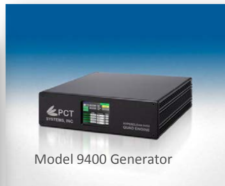
Model 9400 Generator